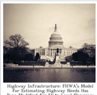
Highway Infrastructure: FHWA's Model for Estimating Highway Needs Has Been Modified for State-Level Planning: GAO-01-299

U.S. Government Accountability Office (GAO)