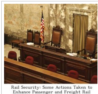
Rail Security: Some Actions Taken to Enhance Passenger and Freight Rail Security, but Significant Challenges Remain: GAO-04-598T

U.S. Government Accountability Office (GAO)