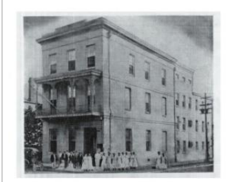
Desha P. Rhodes