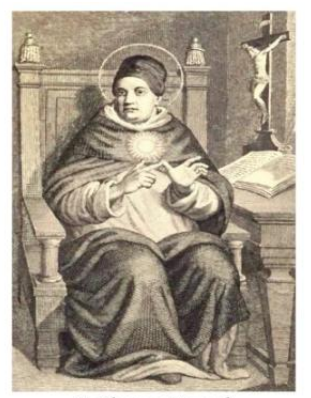
St. Thomas Manual or The Devotion of the Six Sundays in Honor of the Angel of the Schools