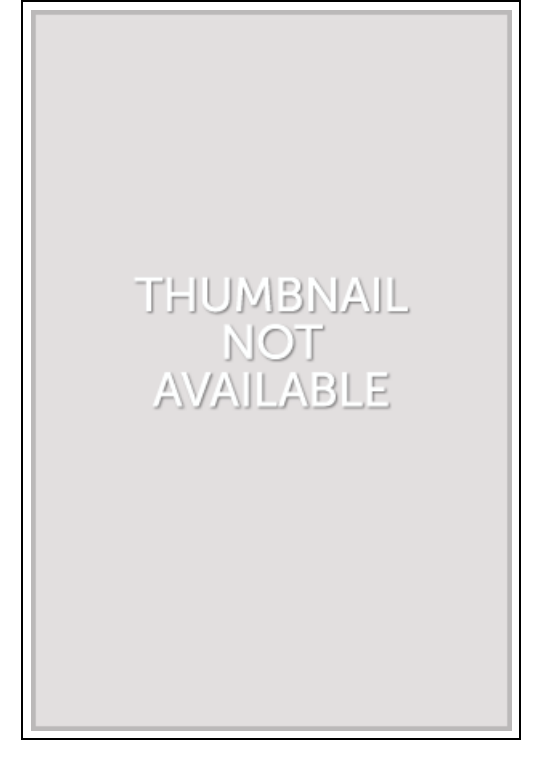
Filesize: 2.2 MB