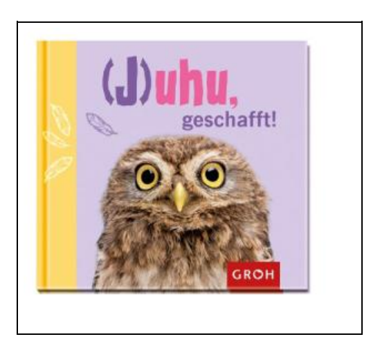
Filesize: 4.14 MB