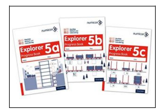
Filesize: 1.42 MB