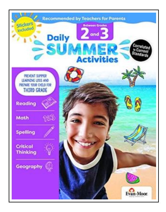
Filesize: 4.12 MB