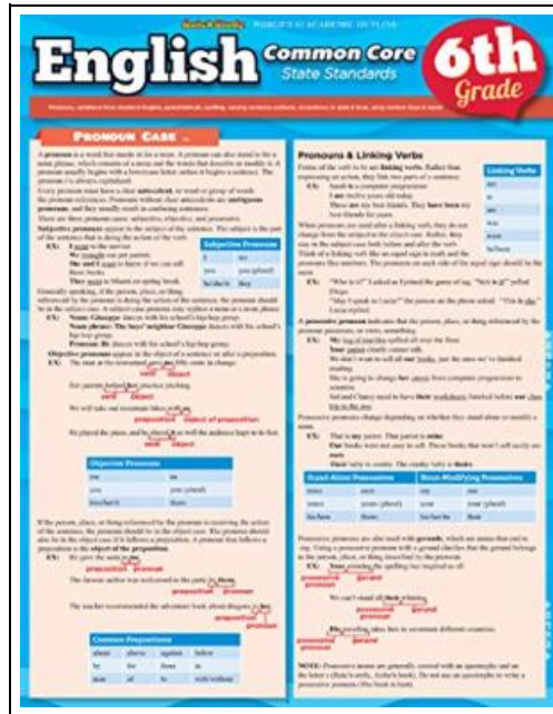
Filesize: 8.11 MB