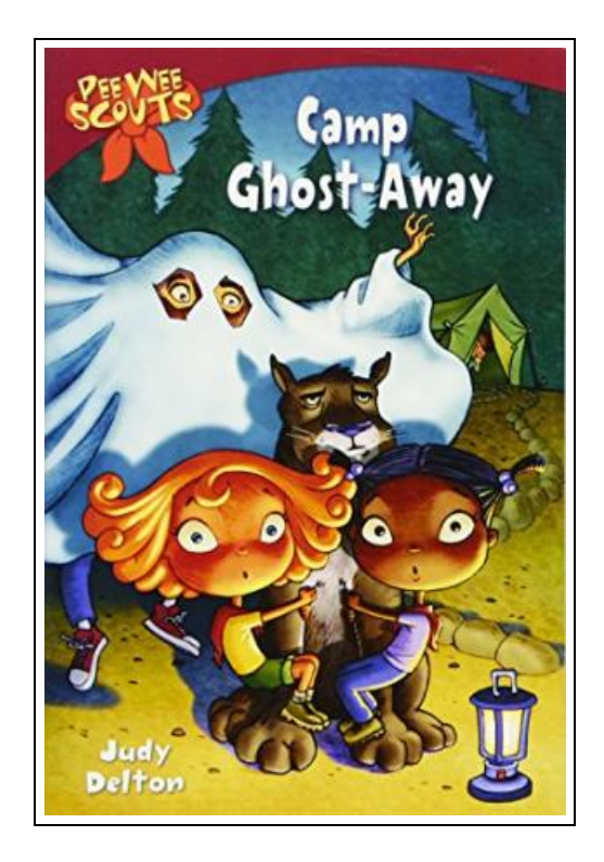
Filesize: 6.79 MB