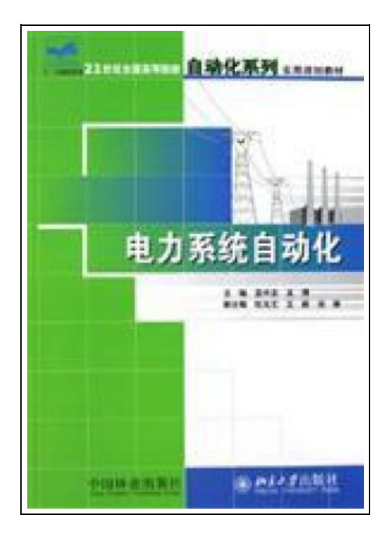
Filesize: 2.89 MB