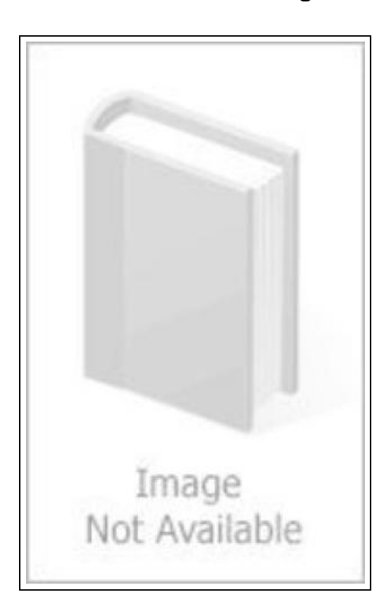
The Art of Weekend Travel: Edinburgh 2003 - 5 Pack