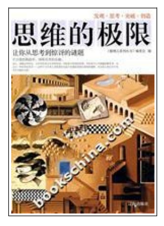
Filesize: 6.51 MB