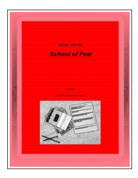
Filesize: 4.04 MB