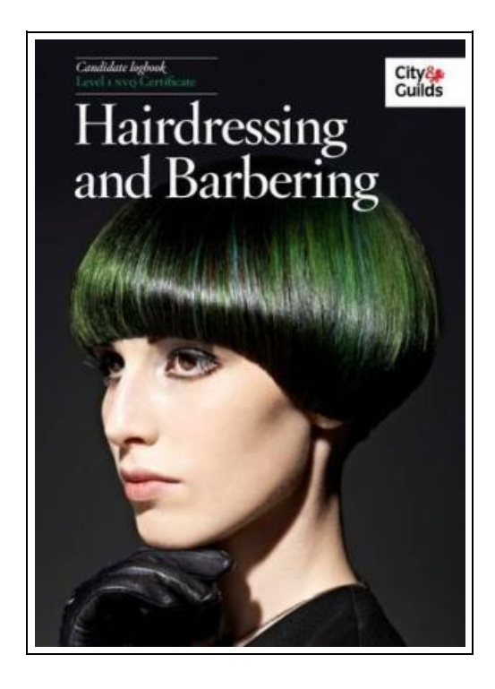
Filesize: 8.62 MB